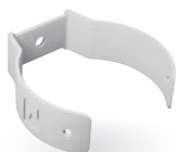
75mm & 90mm Round