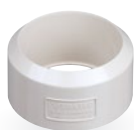
75mm to 90mm Adaptor