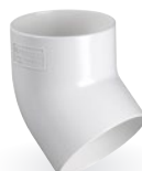
90mm Elbow 45°