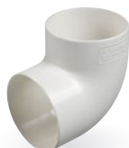
75mm Elbow 95°