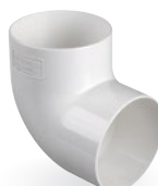
90mm Elbow 95°